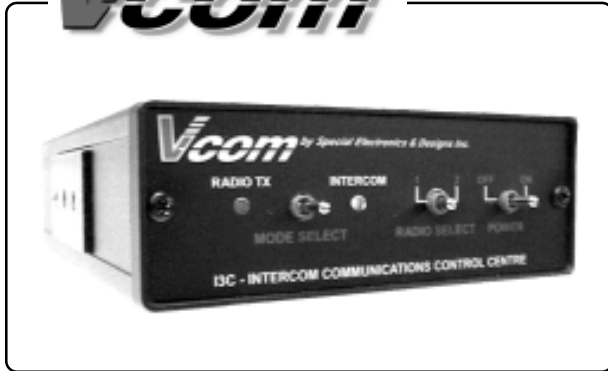
Vcom™ S-200 Control interface accepts connection with 2 radios.

A professional vehicle communications system that won't break your budget.