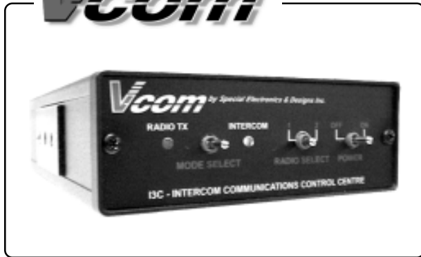
Vcom™ S-200 Control interface accepts connection with 2 radios.

A professional vehicle communications system that won't break your budget.